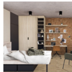
Architect's impressions of the proposed St Catherine's College at Curtin University