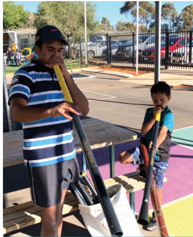
Teaching the didgeridoo to young boys created great bonds of friendship