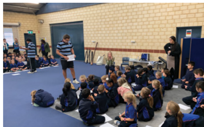
Dandjoo Darbalung residents mentoring at East Kalgoorlie Primary School