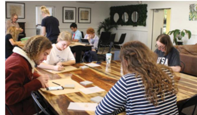
Residents participating in a lino block workshop in our common room

Residents are encouraged to work on their own visual art ideas with the guidance of an experienced artist who is on hand to guide you through techniques, colour theory, composition and more. We even provide all the mediums and materials! This semester residents explored the medium of lino block printing and designed prints to create a t-shirt or silk/muslin print scarf.