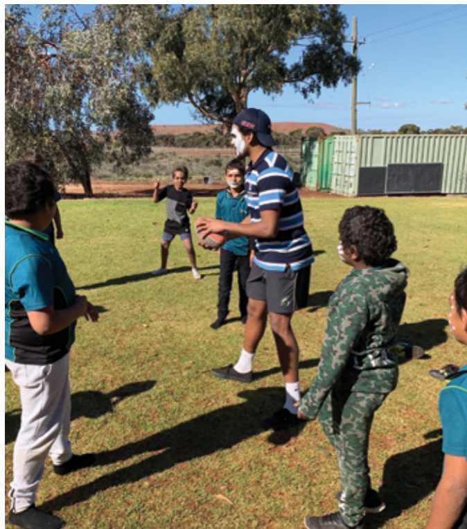
Playing footy remains a firm favourite with younger students