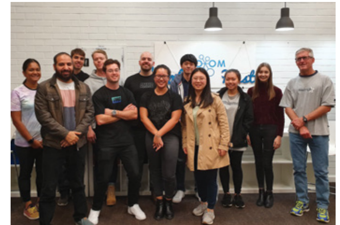
Bloom's Semester 1, 2019 Launchpad cohort

They conclude the semester with a showcase of all the members who have gone through the program and their projects or start-up solutions. Guest speakers for the unit included Ammo Marketing who taught students how to implement the design and marketing processes into their start-ups.