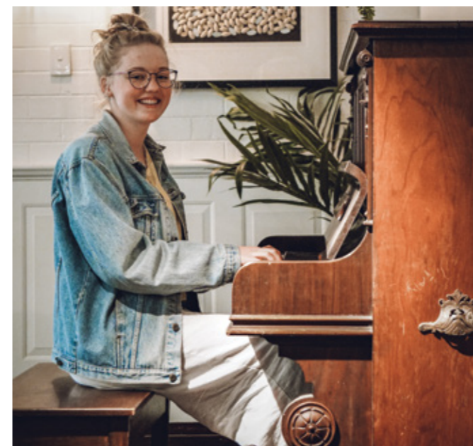
Residents can use one of the three pianos at the College

Whether it's jamming with some buddies or rocking out at the Inter-college Battle of the Bands competition, there's something for everyone! You are encouraged to perform wherever possible – our own residents are regular entertainers at College dinners and social events.