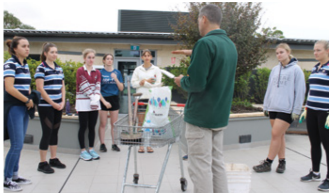
Residents participating in the Honey Bee Project Workshop

We have 479 solar panels on our rooftops, worth over $470,00. The energy generated from these panels offsets about 30% of our energy use which equates to a saving of approximately 257 tonnes of CO 2 emissions and $84,000 in the annual electricity spend.