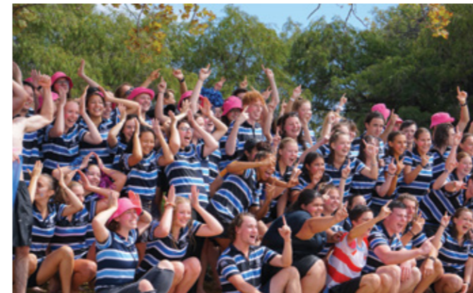
Residents celebrating their Fresher Dance win!

With Battle of the Bands and Debating competitions yet to come, St Catherine's is striving to win the Arts' Cup for the second year running.