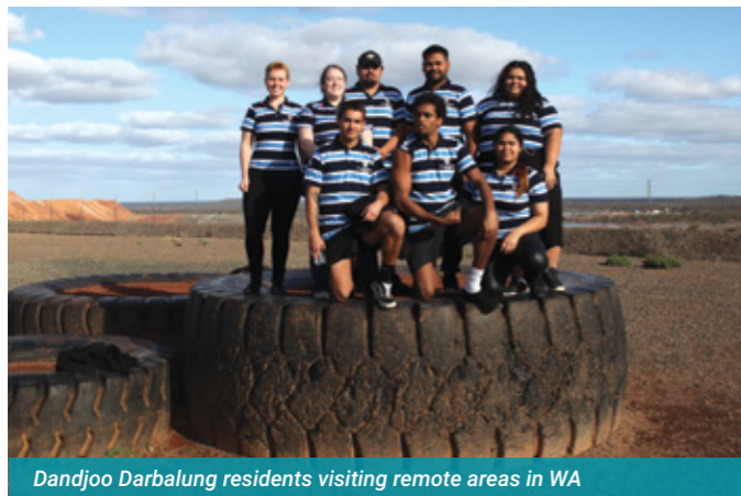
Dandjoo Darbalung residents visiting remote areas in WA

The Dandjoo Darbalung residents regularly participate in mentoring trips to schools in regional and remote areas. The purpose is for the residents to spend time with secondary students to talk about the value of completing high school and aspiring to a university education. They also perform dances and create sand murals, as well as providing positive role modelling to younger students. AngloGold Ashanti recently sponsored a Mentoring trip to Kalgoorlie Boulder Community High School and the Graham Polly Farmer Follow the Dream Centre in Kalgoorlie.