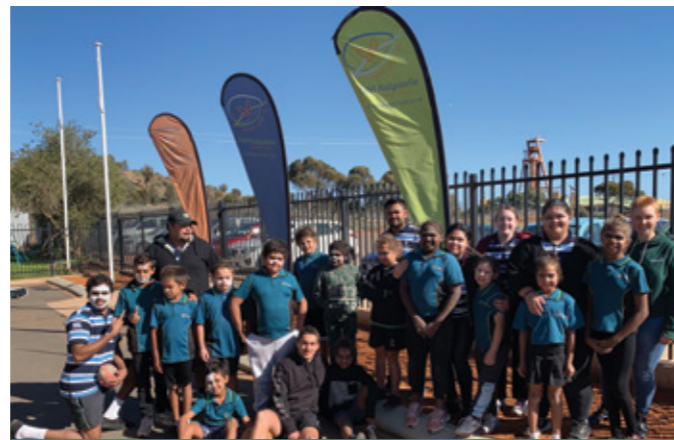
Dandjoo Darbalung students enjoyed the opportunity to meet and inspire the next generation of students